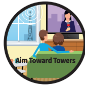
For Tower Locations: antennapoint.com