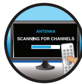
Scanning is a Must When in Doubt, Rescan