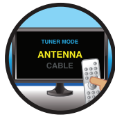
Input on Antenna Mode